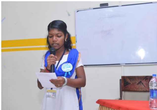
Cultural activities by Asapians.....