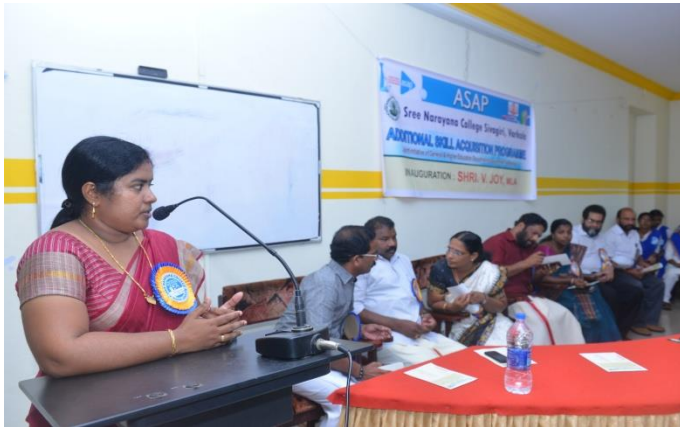
Welcome Speech by Coordinator