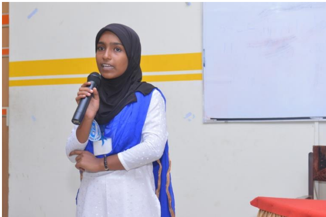
Cultural activities by Asapians.....