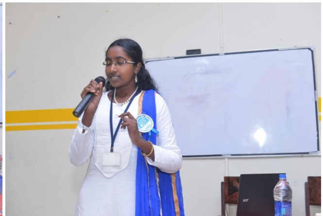
Cultural activities by Asapians.....