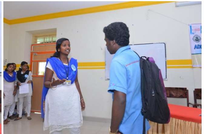
Cultural activities by Asapians.....