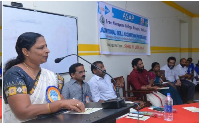
Presidential address by Principal